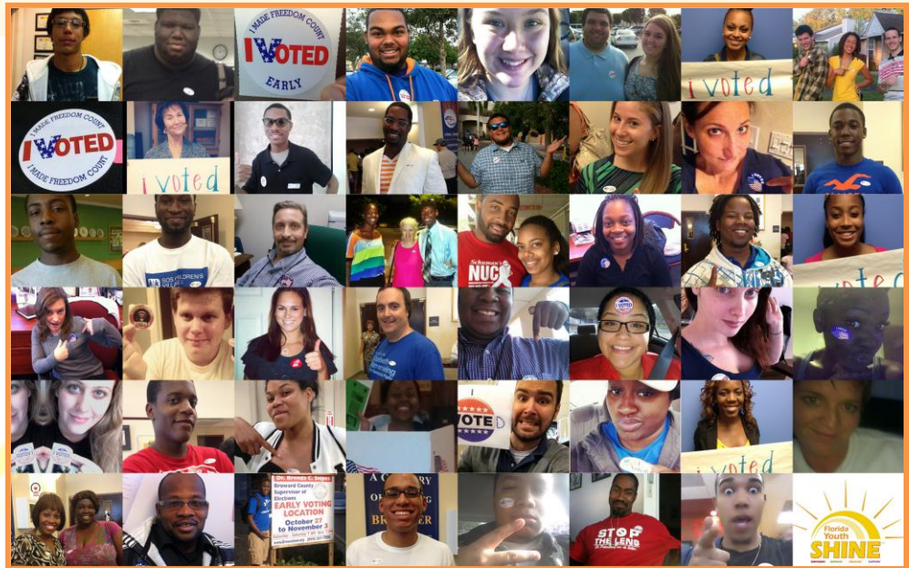
Over 38 members & 18 chapter mentors from ALL 12 FYS chapters captured their post-vote moments.

Early voting. Election Day. First time voters. Democrats. Republicans. Members and mentors alike came out and lived Florida Youth SHINE's mission. Together we became the voice for our brothers, our sisters, and our fellow members who are still in care. Together we had a say in who represents us in our courts, in Tallahassee, and in Washington, DC. Together we voiced our opinion. Together we voted!