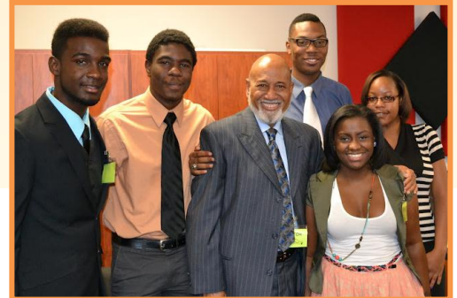
With Broward County's very own Rep. Hastings